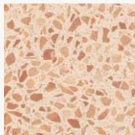
M 1.306 PANDOMO MW and PANDOMO TG rosso 1–3 mm