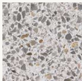
M 3.409 PANDOMO MB and MW PANDOMO TG grigio-chiaro 1–3 mm

All colour standards have been produced by printing process and are intended only by way of recommendation. Colours shown may differ from colours mentioned.