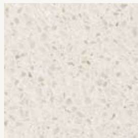
M 1.305 PANDOMO MW and PANDOMO TG bianco 1–3 mm

Produce your very own PANDOMO TerrazzoMicro creation with the terrazzo look. The following illustrations provide examples of the surfaces that can be created on a scale of 1:1. Further detailed information and suggestions can be found in the PANDOMO booklet.