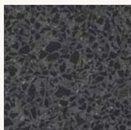
M 2.425 PANDOMO MB and PANDOMO TG nero 1–3 mm