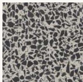
M 1.304 PANDOMO MW and PANDOMO TG nero 1–3 mm